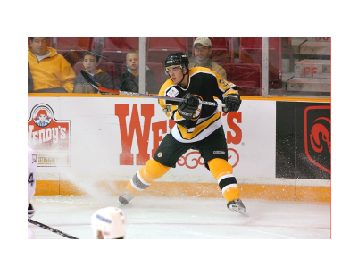
"As a Professional athlete, you have to prepare yourself the right way. The guys at the NEST help me do this and I'm sure they can help you to."